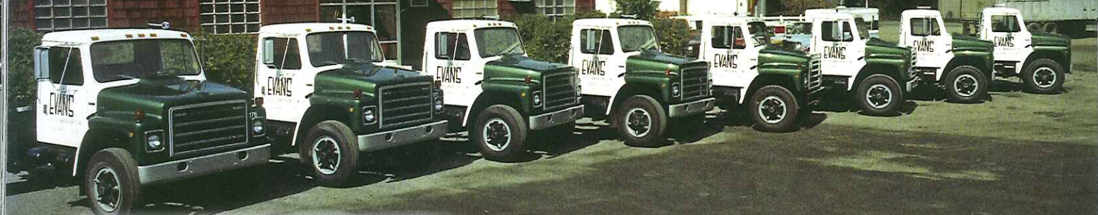
A nice line-up of Internationals in company colors.