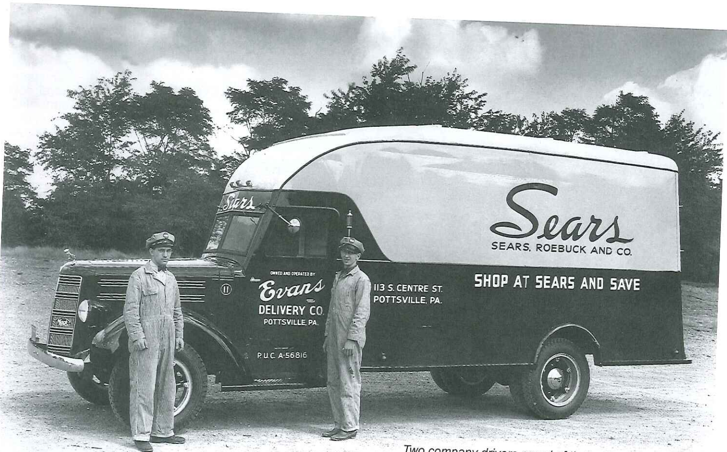
Two company drivers proud of their shiny Mack.