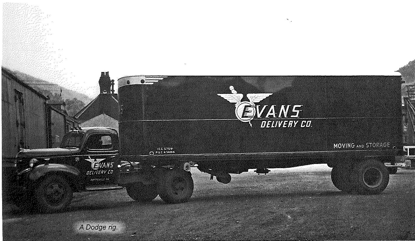
A Dodge rig.