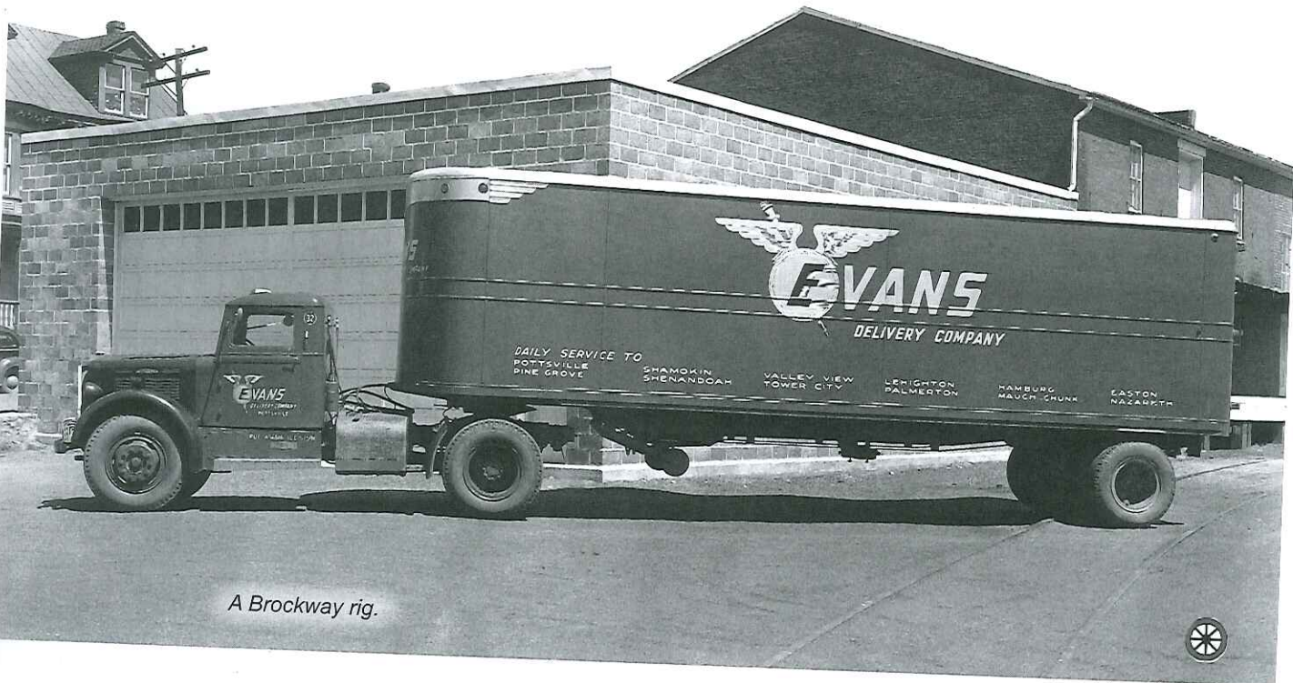
A Brockway rig.