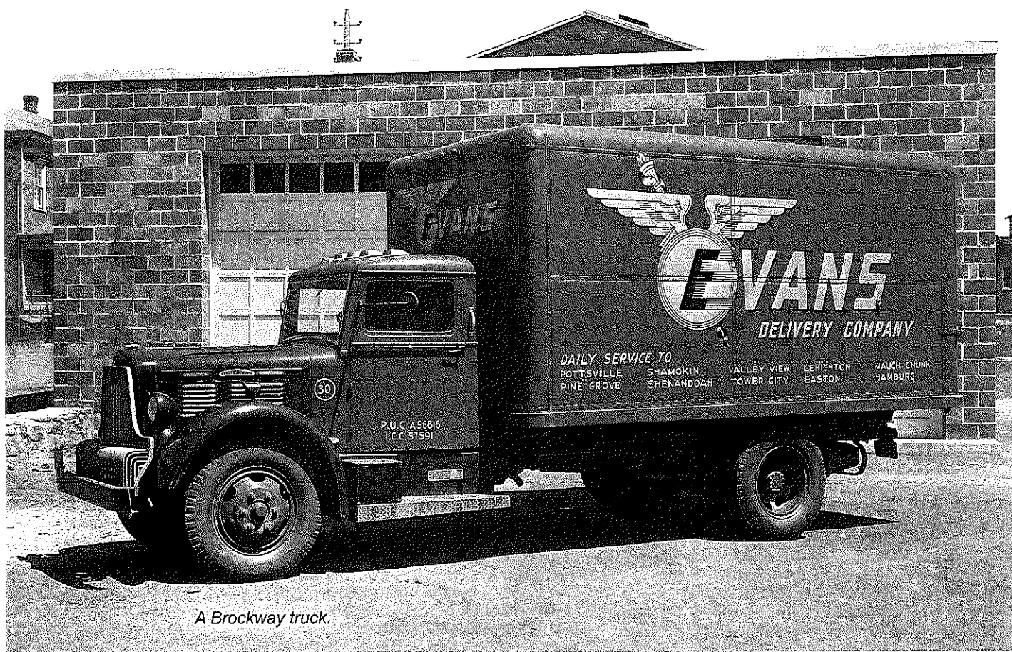
A Brockway truck.